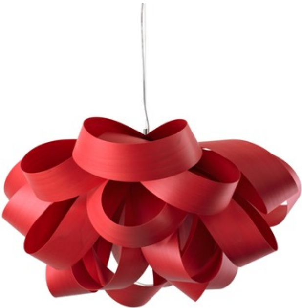
Shown in: Brushed Nickel / Red Wood

The Agatha Pendant, designed by Luis Eslava, has an arresting and dramatic demeanor making this sculptural, physical and versatile. Agatha fills the room with her ambient glow and appealing body. The elegant interlacing whorls of handmade wood veneer strips spring concentrically from its center, their mass blossoming and flourishing. Available in a variety of colors with Brushed Nickel canopy finish. Supplied with 8 foot suspension steel cable and transparent electrical cord. Integrated LED module option dimmable with a Triac or 0-10V dimmer.