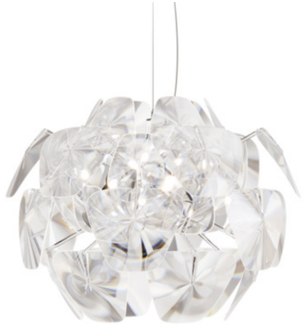
Shown in: Polished Stainless Steel / Transparent

The Hope Pendant features a series of thin polycarbonate fresnel lenses, created using imprinted microprisms on polycarbonate film to achieve a dioptric effect similar to glass without the weight, space and thickness. Features a pressed and bent mirror polished stainless steel frame, injection molded polycarbonate arms and transparent polycarbonate prismatic lenses.