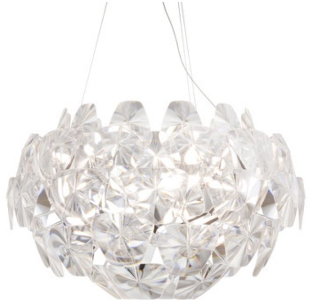
Shown in: Polished Stainless Steel / Transparent

The Hope Suspension features a structure in polished stainless steel and transparent polycarbonate shade. A series of thin polycarbonate fresnel lenses, created using imprinted microprisms on polycarbonate film, achieve a dioptic effect similar to glass