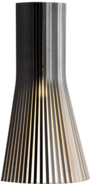
Shown in: Black Laminated Birch

Secto 4231 Wall features a shade made from laminated birch slats available in Natural Birch, White Laminated Birch, Black Laminated Birch or Walnut Birch. Fixture can be mounted so that the light streams upward or downward. ETL listed.