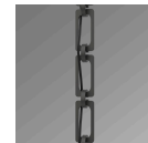
Rectangular Chain (CH3)