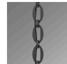
Oval Chain (CH2)