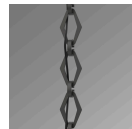
Diamond Chain (CH1)