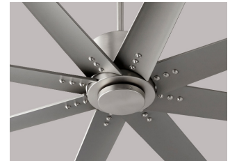
-24 Satin Nickel without light kit