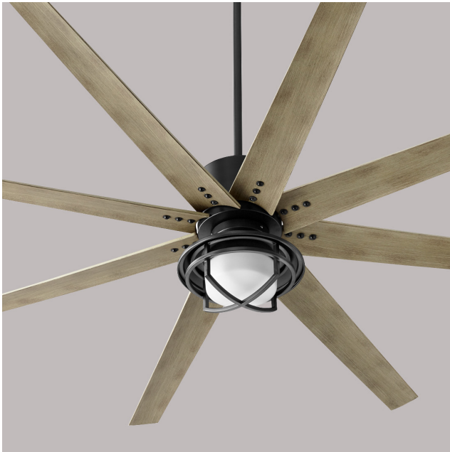
-15 Black with Optional LED Light kit