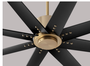
-40 Aged Brass without light kit

SPECIFICATIONS 8 Blades / 72" Blade Sweep / 13° Blade-Pitch 6" downrod (Included) Optional downrods available for high ceilings 6 Speeds - Reversible; 0.30A on high / 0.06A on low 28W on high / 4W on low 100 rpm on high / 50 rpm on low Wall control (Included) Remote control 3-8-2000-0 (Optional)