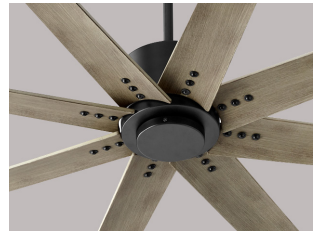
-15 Black without light kit