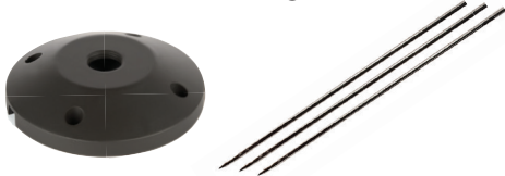
Surface Mount Flange/Stake

Includes three 7 inch threaded stainless steel stabilizing pins for ground mounting or surface mounts with four screws or over a junction box