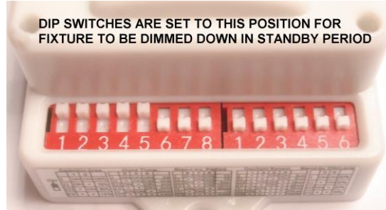
MOTION SENSOR MODULE – FACTORY SETTING DETAIL