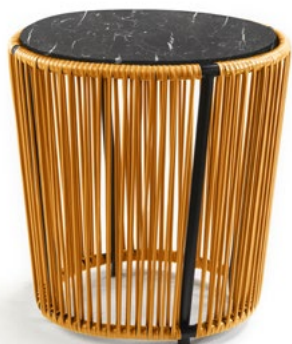
honey yellow/black/ nero marquinia unito 00ACARHTC-A