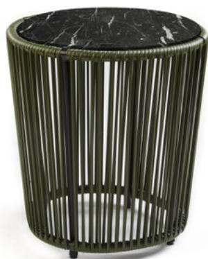
olive green/black/ nero marquinia unito 00ACARHTC-D