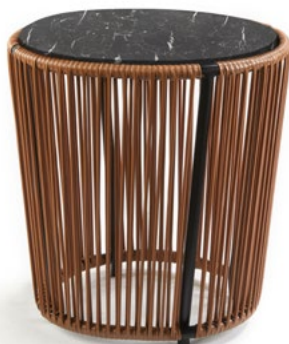
caramel brown/black/ nero marquinia unito 00ACARHTC-B