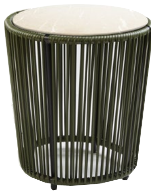
olive green/black/crema nuova 00ACARHTC-H