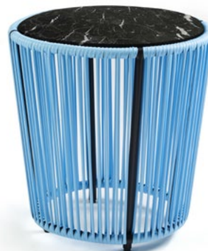
pastel blue/black/ nero marquinia unito 00ACARHTC-C