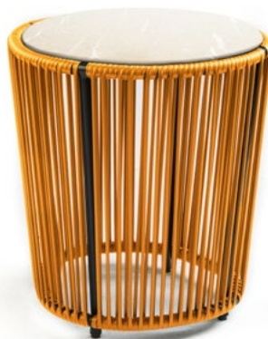
honey yellow/black/crema nuova 00ACARHTC-E