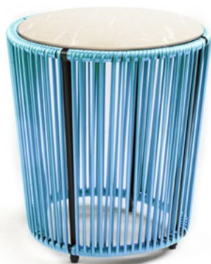
pastel blue/black/crema nuova 00ACARHTC-G