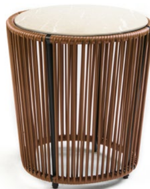
caramel brown/black/crema nuova 00ACARHTC-F