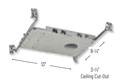
NHIOFK-2 New Construction Frame-In for 2" Remodel Housing