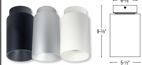
NYLM-5SC Surface Mounted