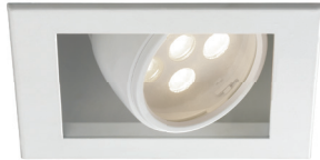
6¾" × 6¾"