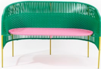
emerald green/ bubblegum rose/curry yellow 01ACASB-F