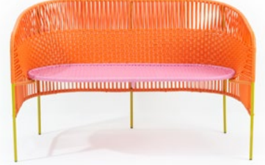
orange/ bubblegum rose/curry yellow 01ACASB-E