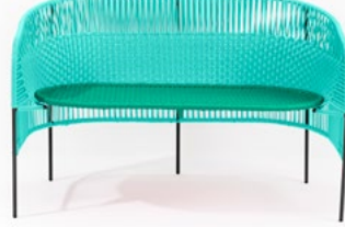
turquoise/ emerald green/black 01ACASB-C