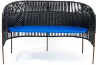
signal blue/ turquoise/black 01ACASB-B