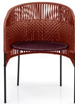
copper/black red/black 01ACADC-O