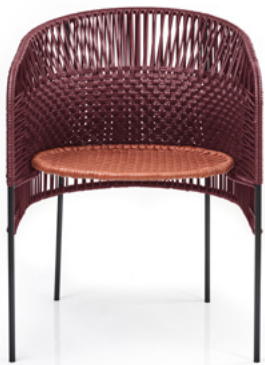
black red/copper/black 01ACADC-N