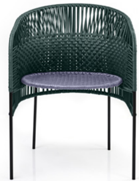
moss green/dark blue/black 01ACADC-P