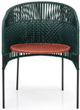
moss green/copper/black 01ACADC-I