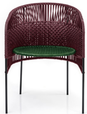
black red/moss green/black 01ACADC-M