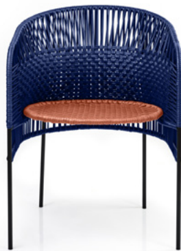
dark blue/copper/black 01ACADC-J