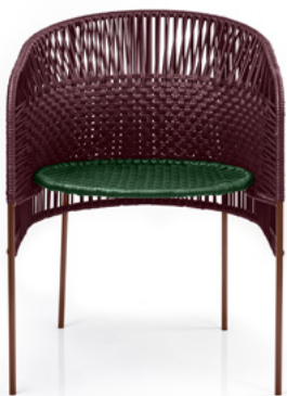
black red/moss green/copper 01ACADC-Q