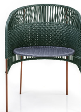
moss green/dark blue/copper 01ACADC-R