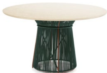
crema nuova/moss green/copper 01ACAMD-E