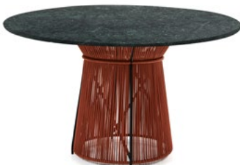
verde guatemala/copper/black 01ACAMD-K