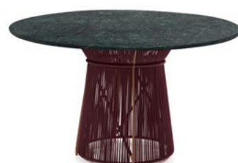
verde guatemala/black red/copper 01ACAMD-J