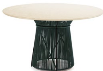
crema nuova/moss green/black 01ACAMD-F