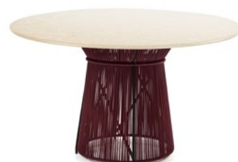
crema nuova/black red/black 01ACAMD-G