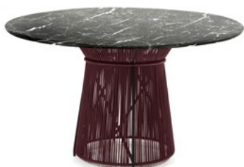
nero marquinia unito/black red/black 01ACAMD-H