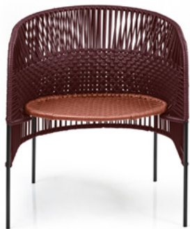
black red/copper/black 01ACALC-N