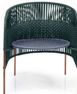
moss green/dark blue/copper 01ACALC-R