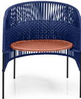
dark blue/copper/black 01ACALC-J