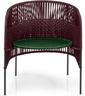
black red/moss green/black 01ACALC-M