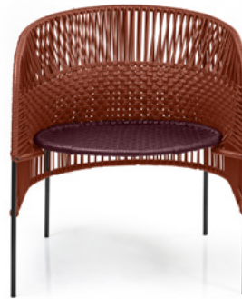
copper/black red/black 01ACALC-O