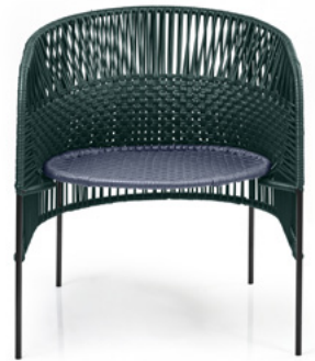
moss green/dark blue/black 01ACALC-P