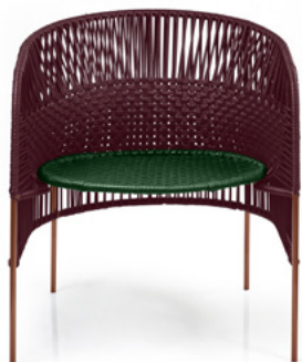
black red/moss green/copper 01ACALC-Q