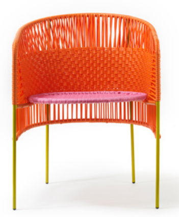
orange/ bubblegum rose/curry yellow 01ACADC-E

turquoise/ emerald green/black 01ACADC-C