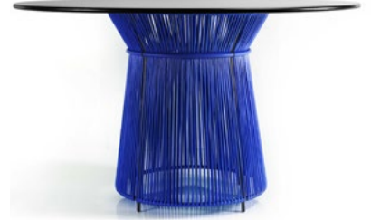
signal blue/black 01ACADT-SB1