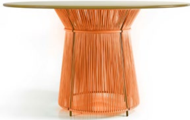
orange/curry yellow 01ACADT-CY1