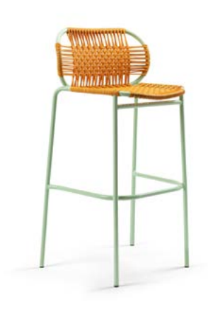
honey yellow/pastel green 00ACBS-6