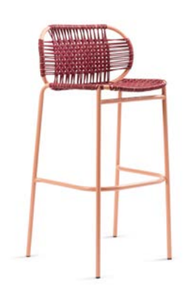
red/pink sand 00ACBS-5