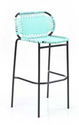
light green/black 00ACBS-2