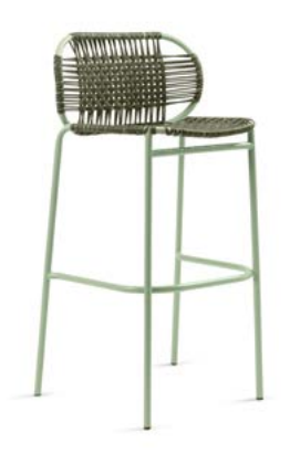
olive green/pastel green 00ACBS-4