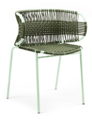
olive green/pastel green 00ACSCA-4