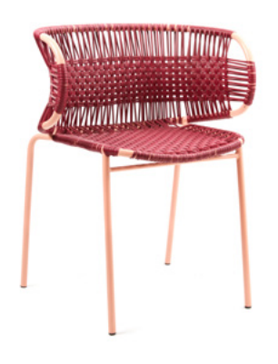
red/pink sand 00ACSCA-5