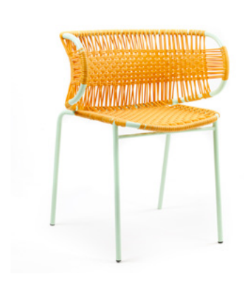
honey yellow/pastel green 00ACSCA-6