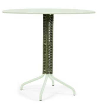
pastel green/olive green/ pastel green 00ACTME60-4