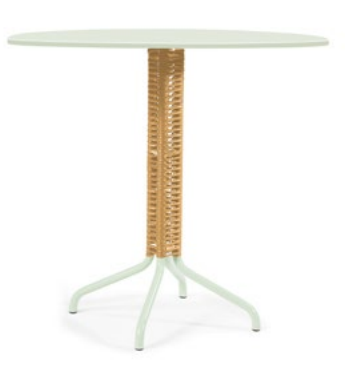
pastel green/honey yellow/ pastel green 00ACTME60-6