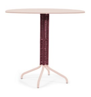
pink sand/red/ pink sand 00ACTME60-5