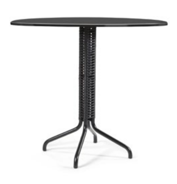
black/black/ black 00ACTME60-3