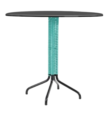
black/light green/ black 00ACTME60-2