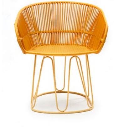
honey yellow/yellow 00ACIDC-B