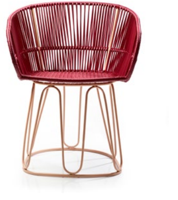
red/pink sand 00ACIDC-C