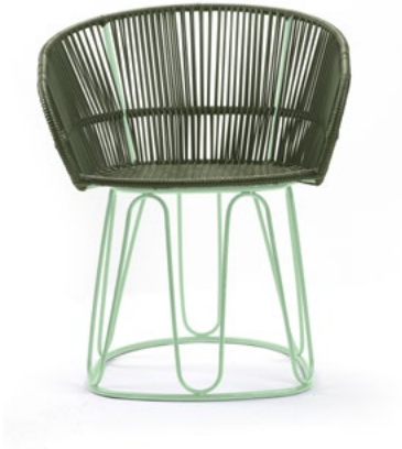
olive green/pastel green 00ACIDC-A