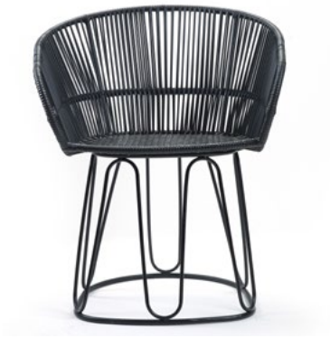
matt black/black 00ACIDC-D