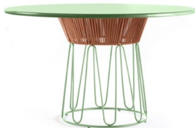
cognac brown/pastel green 00ACIDTL-A