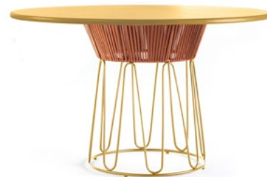
cognac brown/yellow 00ACIDTL-C