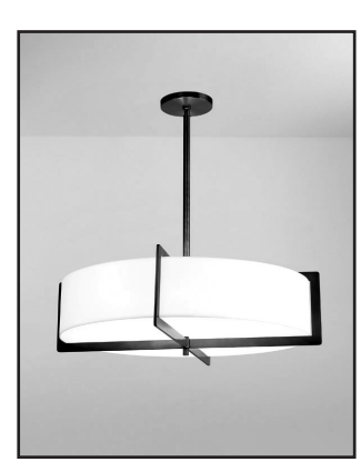
10118 Crisscross Pendant