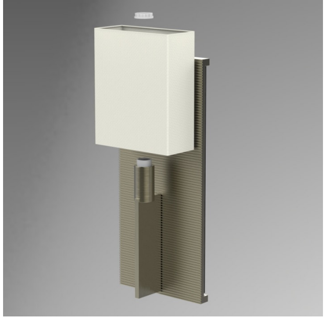
Figure 5 Figure 6