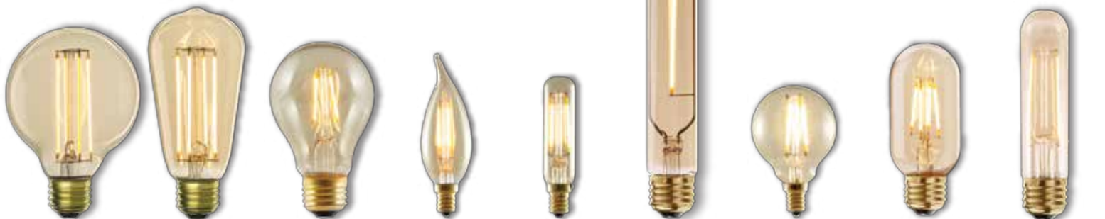
LED4G25/22K/FIL-NOS LED4ST18/22K/FIL-NOS LED4A19/22K/FIL-NOS LED2CA10/22K/FIL-NOS LED2T6/22K/FIL-NOS LED4T9L/22K/FIL-NOS LED2G16/22K/FIL-NOS LED4T14/22K/FIL-NOS LED2T9/22K/FIL-NOS