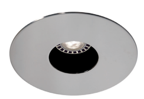
R3652-04BR-02 (illustrated) (Lamp not included)