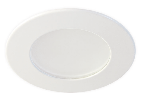
S2000-11 (illustrated) (Lamp not included)