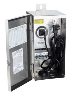
MAGNETIC TRANSFORMER shown in stainless steel