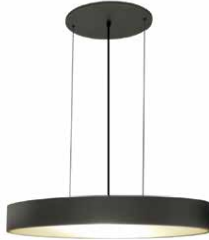
VEGA-OV-_-BK Vega Oval shown in Black.