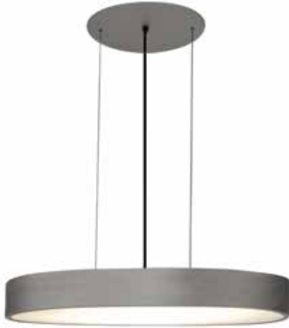
VEGA-OV-_-SI Vega Oval shown in Silver.