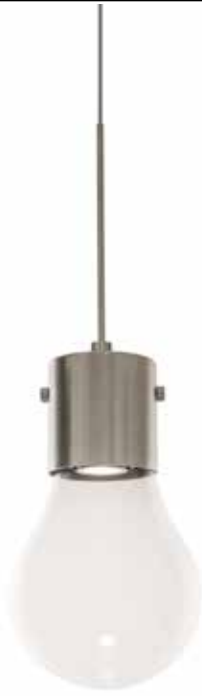
FJ-DROP2-_-_-SN Satin Nickel