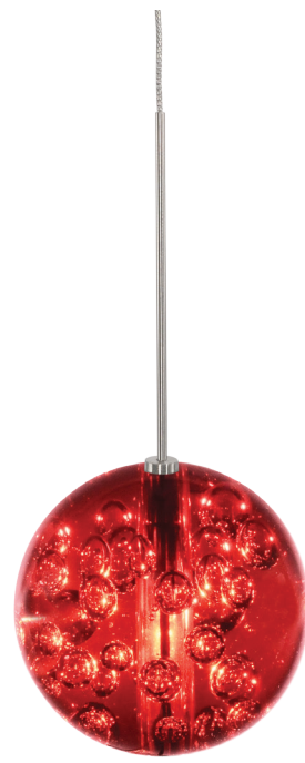
FJ-BBRL27-10FT-12-SN Ruby Red