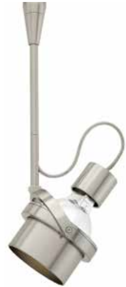
FJ-FOR-RD-6-SN + ST16-SN Satin Nickel with Snoot accessory in Satin Nickel (sold separately)