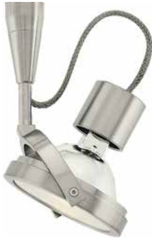
FJ-FOR-RD-3-SN Satin Nickel