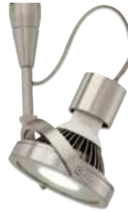
FJ-FOR-RD-3-SN Satin Nickel with LED MR16 lamp (sold separately)