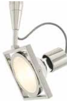
FJ-FOR-SQ-3-PN Polished Nickel