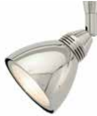
FJ-LOW-1-PN-S1-PN Polished Nickel with Polished Nickel S1 Shade