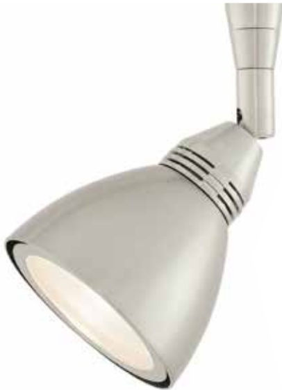
FJ-LOW-1-SN-S1-SN Satin Nickel with Satin Nickel S1 Shade