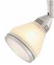
FJ-LOW-1-SN-S3-WH-SN Satin Nickel with Satin Nickel S3 White Shade