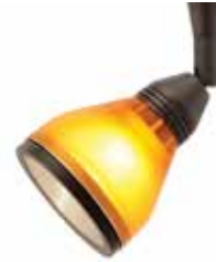
FJ-LOW-1-BZ-S3-AM-BZ Antique Bronze with Antique Bronze S3 Amber Shade