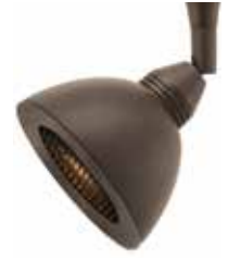
FJ-LOW-1-BZ-S5-BZ Antique Bronze with Antique Bronze S5 Shade