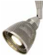
FJ-LOW-1-SN-S2-PN Satin Nickel with Polished Nickel S2 Shade & LED MR16 lamp