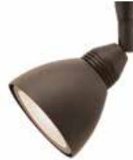
FJ-LOW-1-BZ-S1-BZ Antique Bronze with Antique Bronze S1 Shade