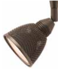
FJ-LOW-1-BZ-S2-BZ Antique Bronze with Antique Bronze S2 Shade