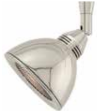
FJ-LOW-1-PN-S5-PN Polished Nickel with Polished Nickel S5 Shade