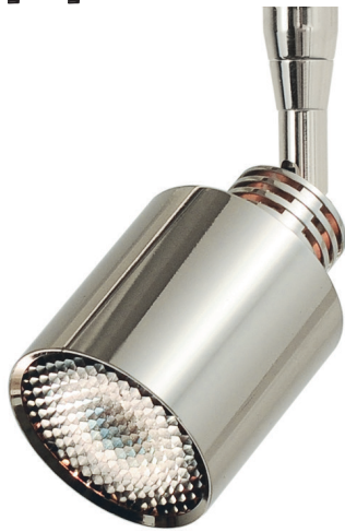
FJ-REB-1-PN Polished Nickel