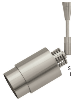
FJ-REB-3-SN + ST16-SN Satin Nickel with Snoot accessory in Satin Nickel (sold separately)