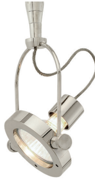
FJ-HAR-5-PN Fast Jack Harley in Polished Nickel