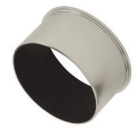
ST16-SN Snoot Accessory (sold separately)