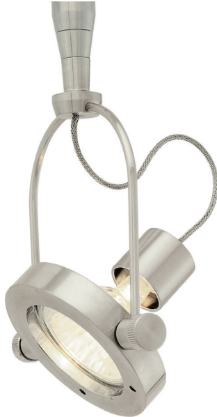
FJ-HAR-5-SN Fast Jack Harley in Satin Nickel