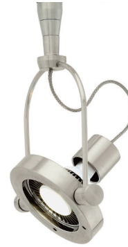
FJ-HAR-5-SN Fast Jack Harley in Satin Nickel with LED MR16 lamp