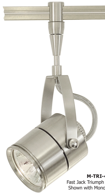
M-TRI-4-SN Fast Jack Triumph in Satin Nickel. Shown with Monorail connector.