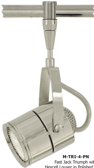
M-TRI-4-PN Fast Jack Triumph with Hexcell Louver in Polished Nickel. Shown with Monorail connector.