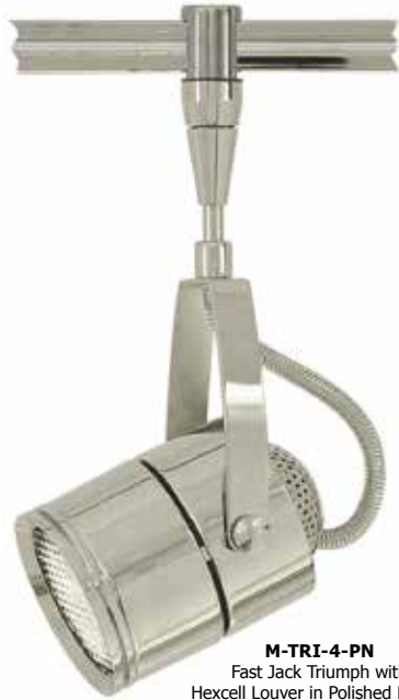
M-TRI-4-PN Fast Jack Triumph with Hexcell Louver in Polished Nickel. Shown with Monorail connector.