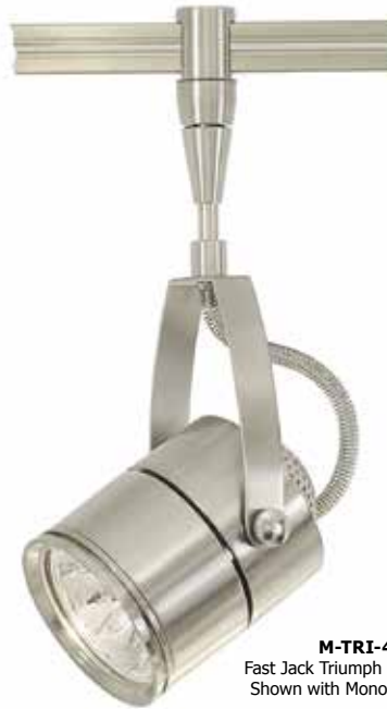
M-TRI-4-SN Fast Jack Triumph in Satin Nickel. Shown with Monorail connector.