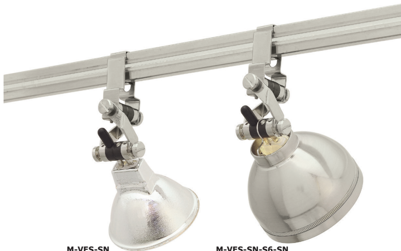
M-VES-SN Satin Nickel with MR16 Lamp (sold separately) LED Compatible