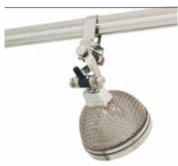
M-VES-SN-S3-AM-SN Satin Nickel with Satin Nickel S3 Amber Shade

M-VES-PN-S7-PN Vespa in Polished Nickel with Polished Nickel S7 Shade LED Compatible