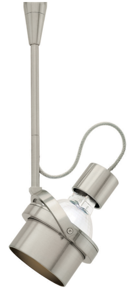
FJ-FOR-RD-6-SN + ST16-SN Satin Nickel with Snoot accessory in Satin Nickel (sold separately)