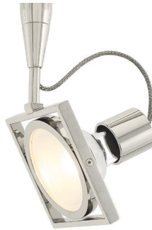
FJ-FOR-SQ-3-PN Polished Nickel