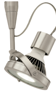
FJ-FOR-RD-3-SN Satin Nickel with LED MR16 lamp (sold separately)