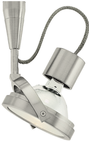
FJ-FOR-RD-3-SN Satin Nickel