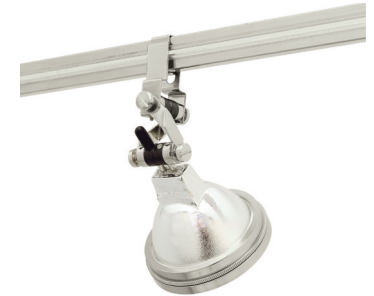
M-VES-SN-LH16-SN Satin Nickel with Satin Nickel Louver Lens Holder LED Compatible