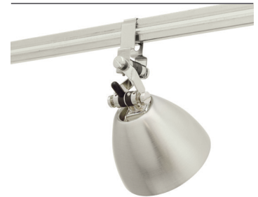
M-VES-SN-S1-SN Satin Nickel with Satin Nickel S1 Shade