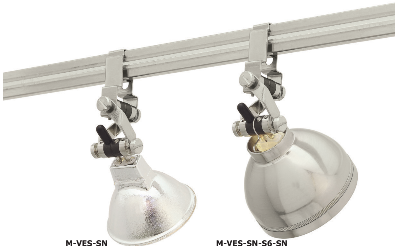
M-VES-SN Satin Nickel with MR16 Lamp (sold separately) LED Compatible