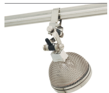
M-VES-PN-S7-PN Vespa in Polished Nickel with Polished Nickel S7 Shade LED Compatible