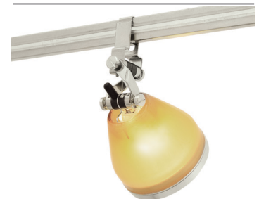
M-VES-SN-S3-AM-SN Satin Nickel with Satin Nickel S3 Amber Shade