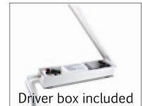
Driver box included