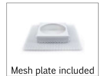
Mesh plate included