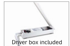
Driver box included