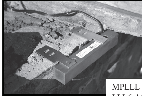
MPLLL on LLL6-AC