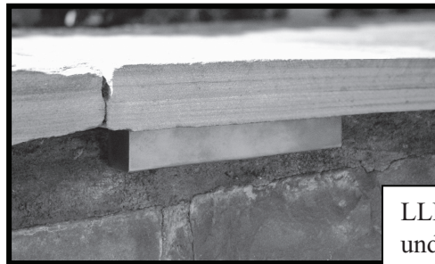
LLL6-AC installed under cap stone

Read these instructions carefully before installing this fixture.