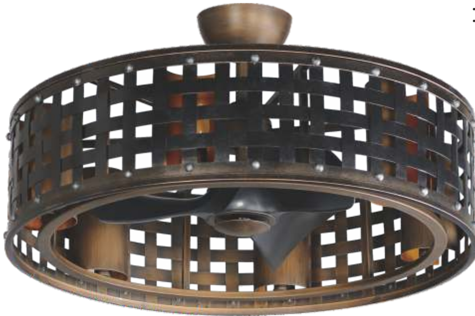
61016BZGT Fandelight A