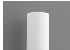
Matte White Acrylic