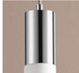
-14 Polished Chrome