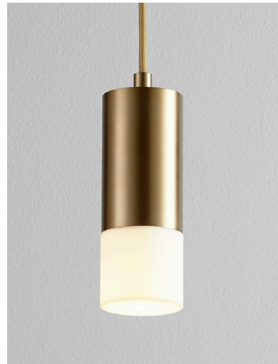
-40 Aged Brass