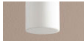
-1 White Opal Glass