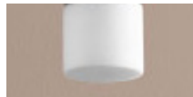
- Matte White Acrylic