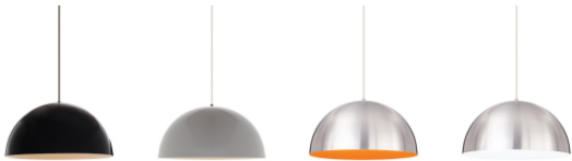
gloss black / white gloss white / white satin nickel / sunrise orange satin nickel / white