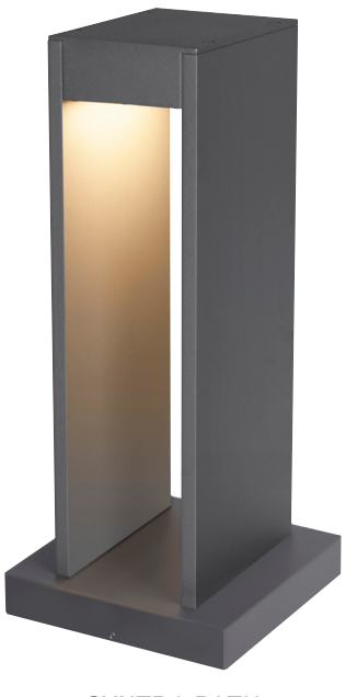
SYNTRA PATH shown in charcoal