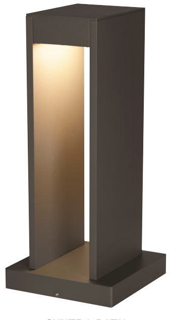
SYNTRA PATH shown in bronze